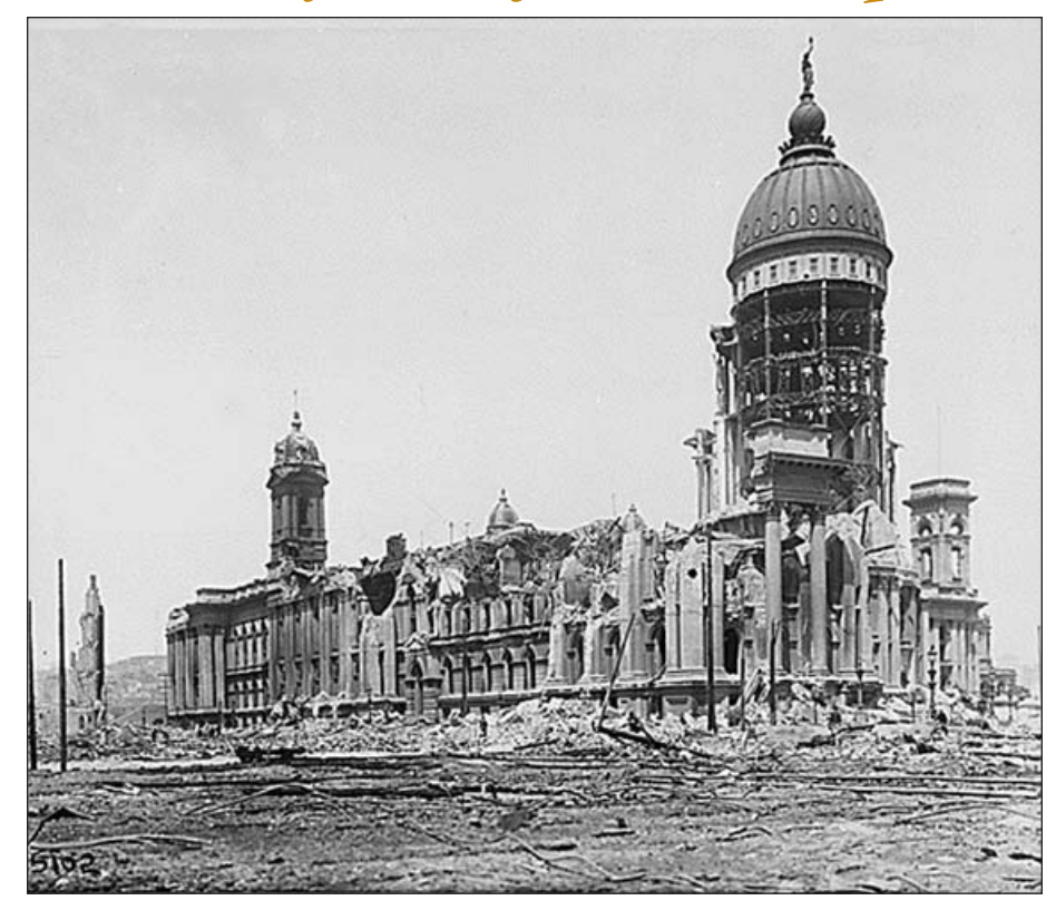
San Francisco City Hall after the 1906 earthquake