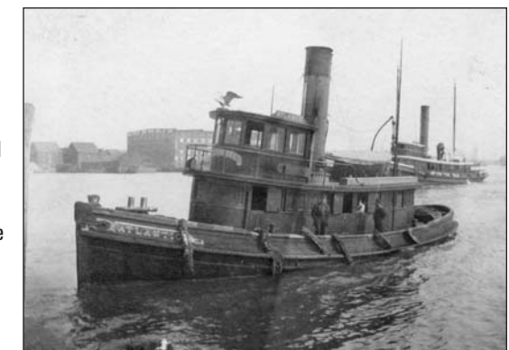
The tugboat "Atlantic"