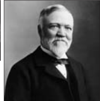
Andrew Carnegie, "patron saint" of libraries.

The Carnegie Library of Homestead, Pa., overlooks the site of one of Carnegie's steel plants along the Monongahela River just outside of Pittsburgh.